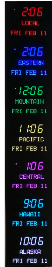
Model 3073Q - 2.5" time, 1.2" zone labels, 1.2" date, 7 zones